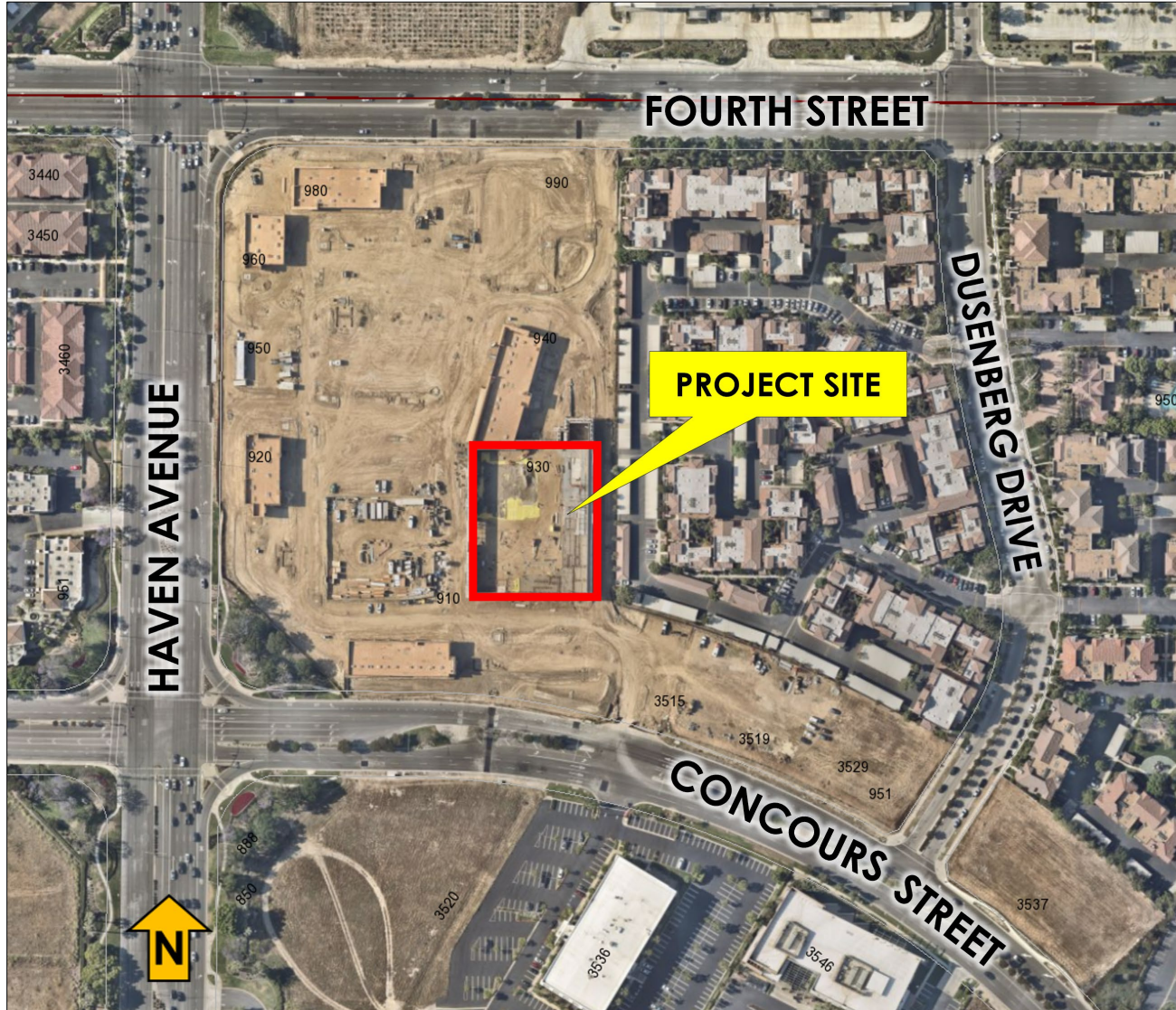
Exhibit A: PROJECT LOCATION MAP