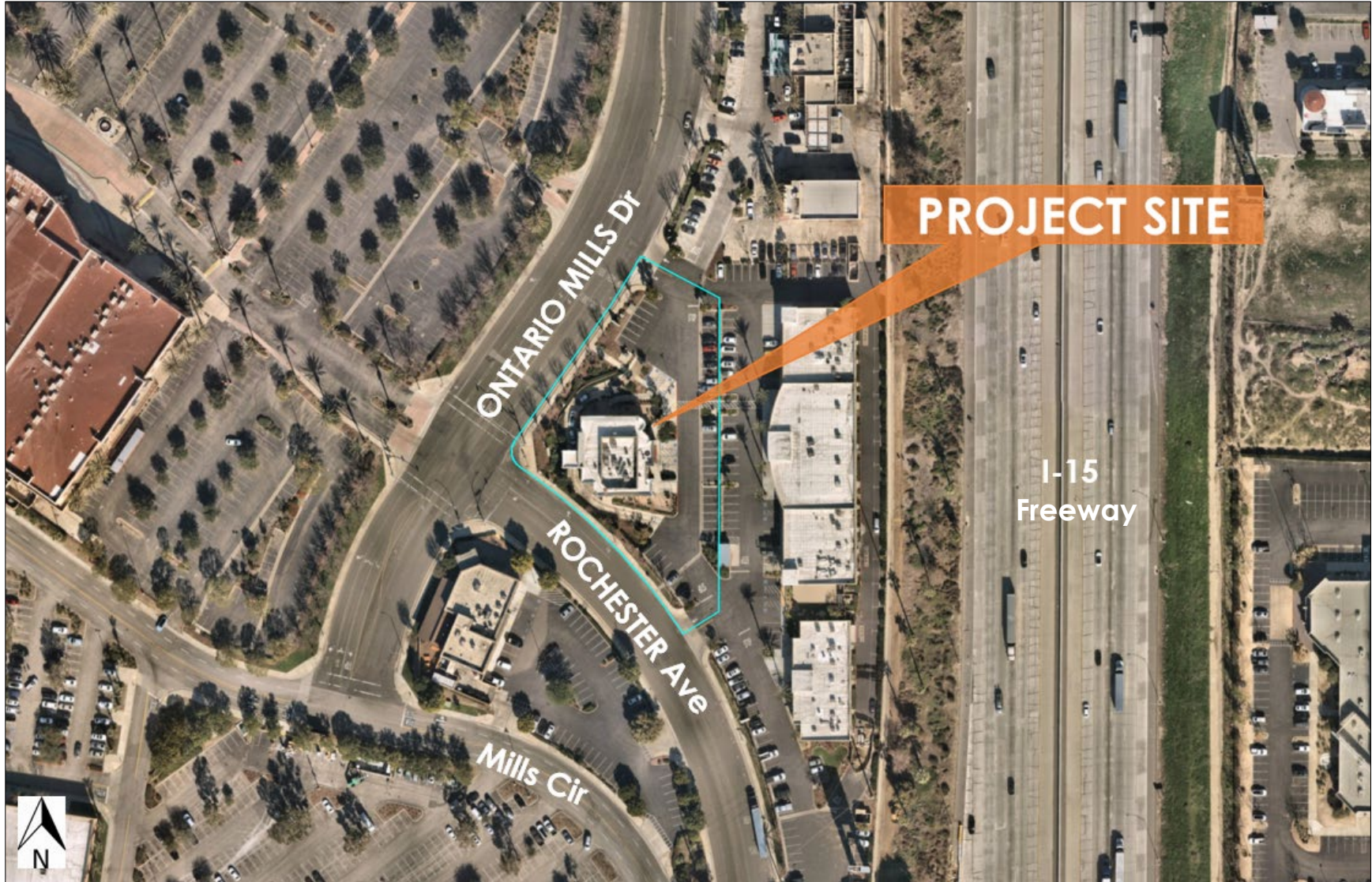
Exhibit A: PROJECT LOCATION MAP