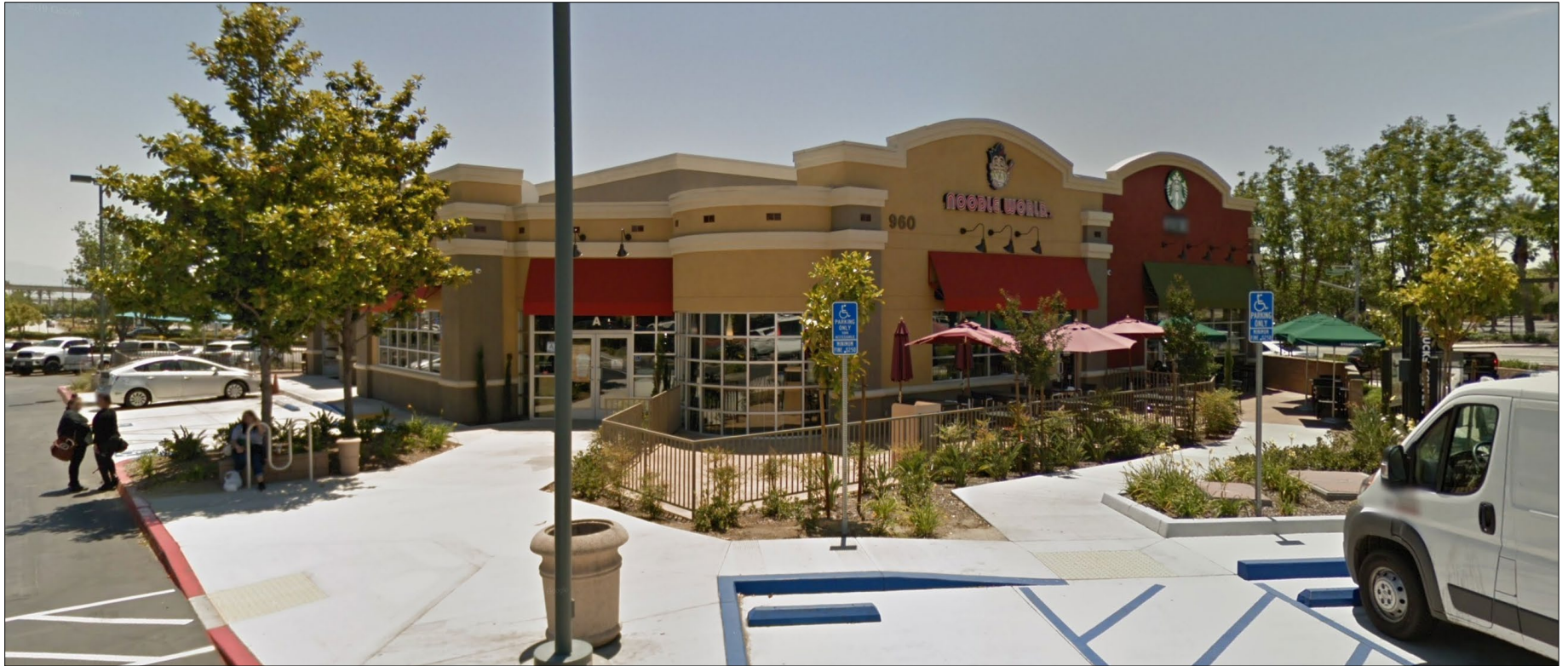
Project site entrance, formerly Noodle World Jr.