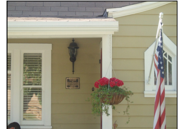
Plaque location at entry to home