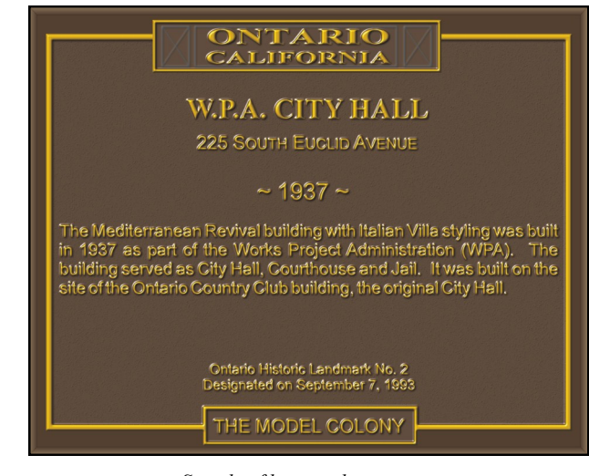
Sample of bronze plaque

There are approximately two dozen historic properties that have received plaques as of 2008.