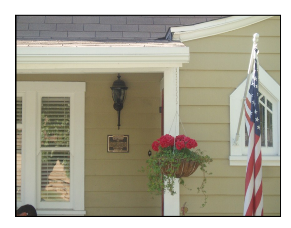
Plaque location at entry to home