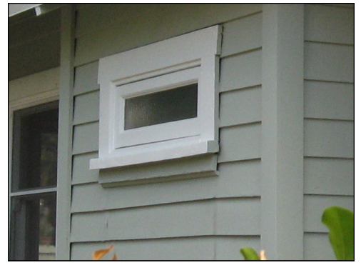
Example of an appropriate window alteration

303 East B Street Ontario, CA 91764 Phone: (909) 395-2036 www.ontarioca.gov