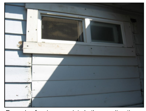
Example of an inappropriate bathroom alteration