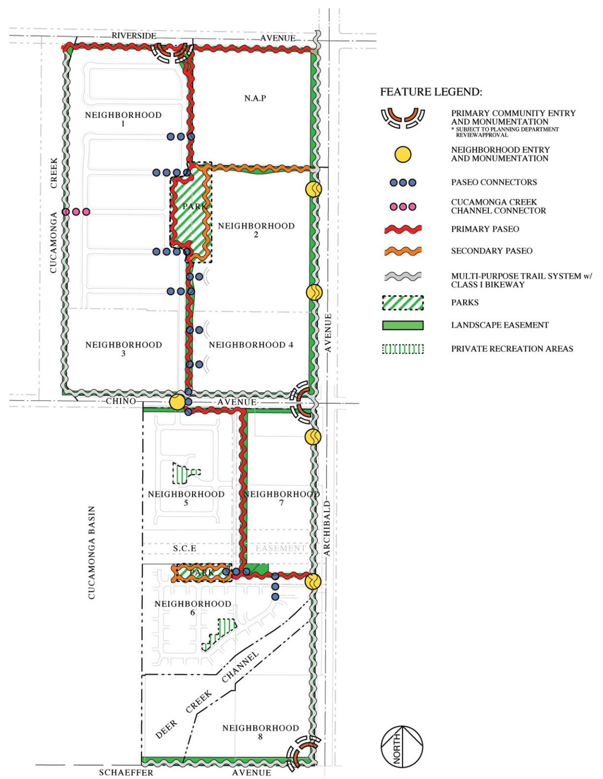
Exhibit 11 Parks and Paseo Concept