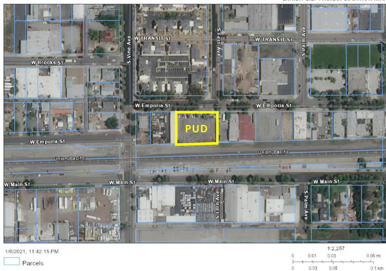
EXHIBIT 1.1: PROJECT LOCATION MAP

City staff and private developers shall rely on this Plan to determine whether proposed development plans for the Property are adequate and meet the City's land use and design objectives.