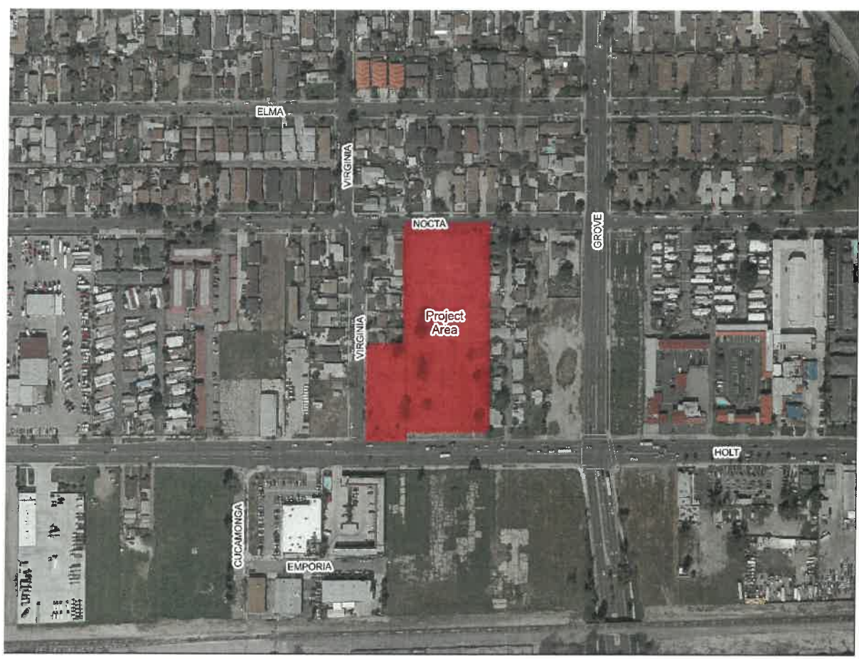
EXHIBIT A PROJECT SITE