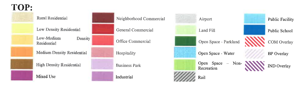
Exhibit A: Proposed General Plan Amendment