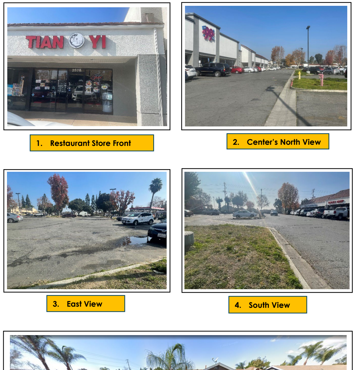
Exhibit D: SITE PHOTOS