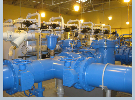
John Galvin Ion Exchange Treatment Plant Placed into Service in October 2009