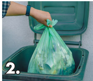
2. Place bagged food waste inside your green waste can!