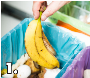
1. Bag food scraps & food waste. Any bag is acceptable!

FOLLOW THESE TWO EASY STEPS FOR RECYCLING YOUR FOOD SCRAPS!