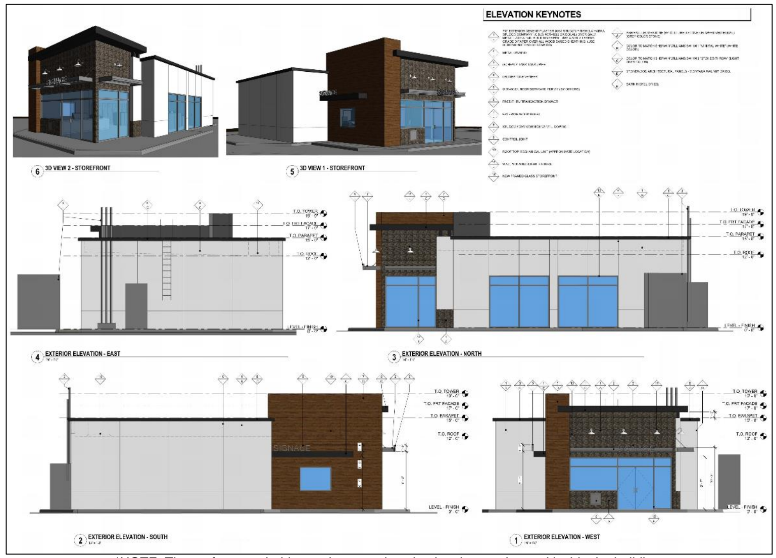
*NOTE: The roof-access ladder on the east elevation has been relocated inside the building.