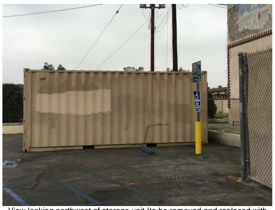
View looking northwest of storage unit (to be removed and replaced with landscaping)