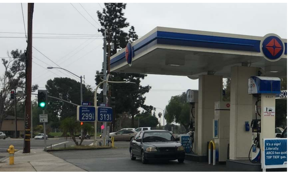
View looking south from northeast corner of site