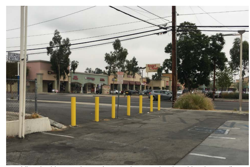
View looking northeast (area to be re-striped and landscaped)