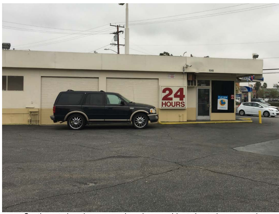
Southwest elevation: garage bay doors, cabinet sign to be removed