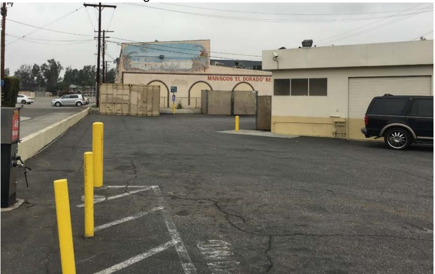
View looking north along the west property line (future landscape buffer)