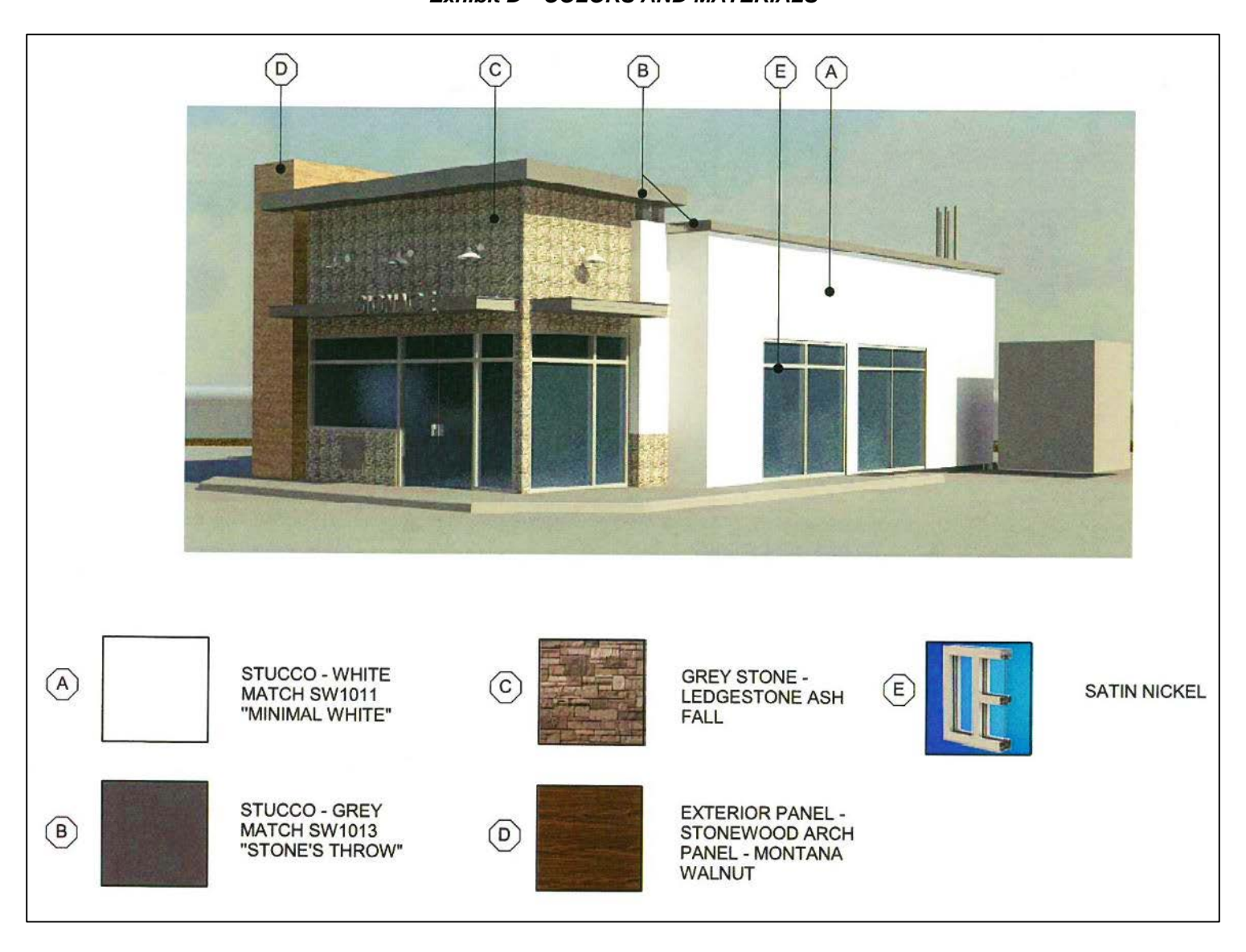
Exhibit D—COLORS AND MATERIALS