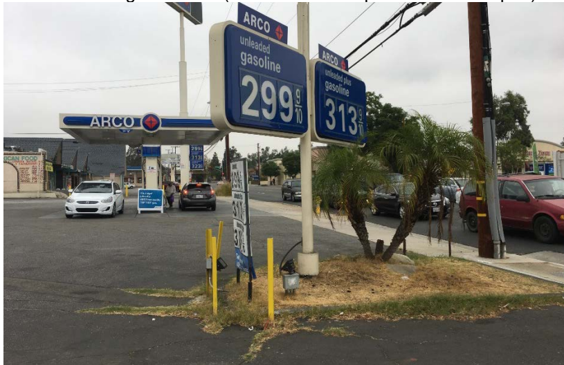
View looking north of small landscape area at the southeast corner of the site