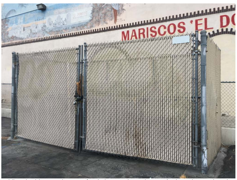
View looking northwest of existing trash enclosure (to be relocated and updated)