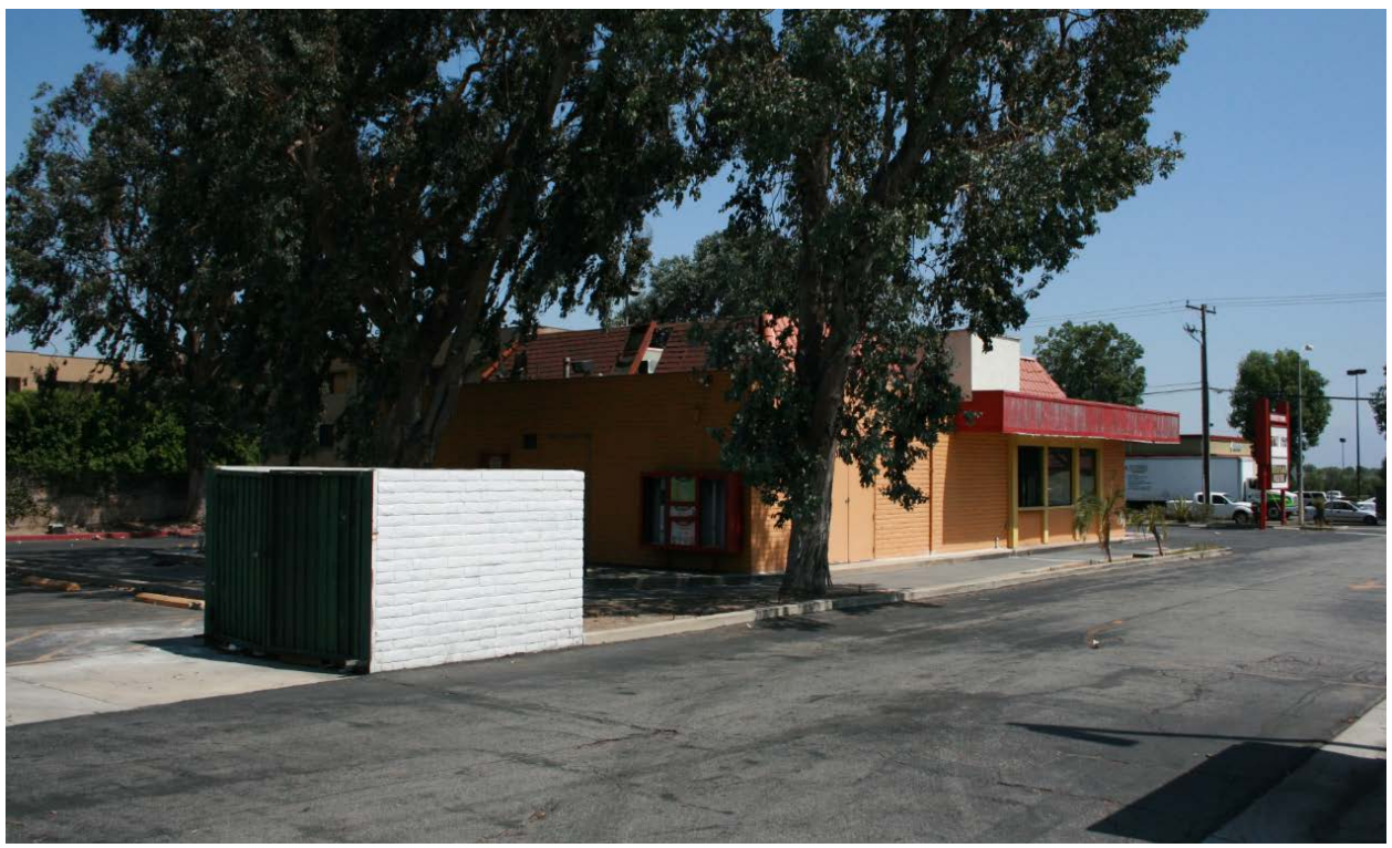
View of the northwest corner of the building and existing drive thru and shared access aisle with adjoining property