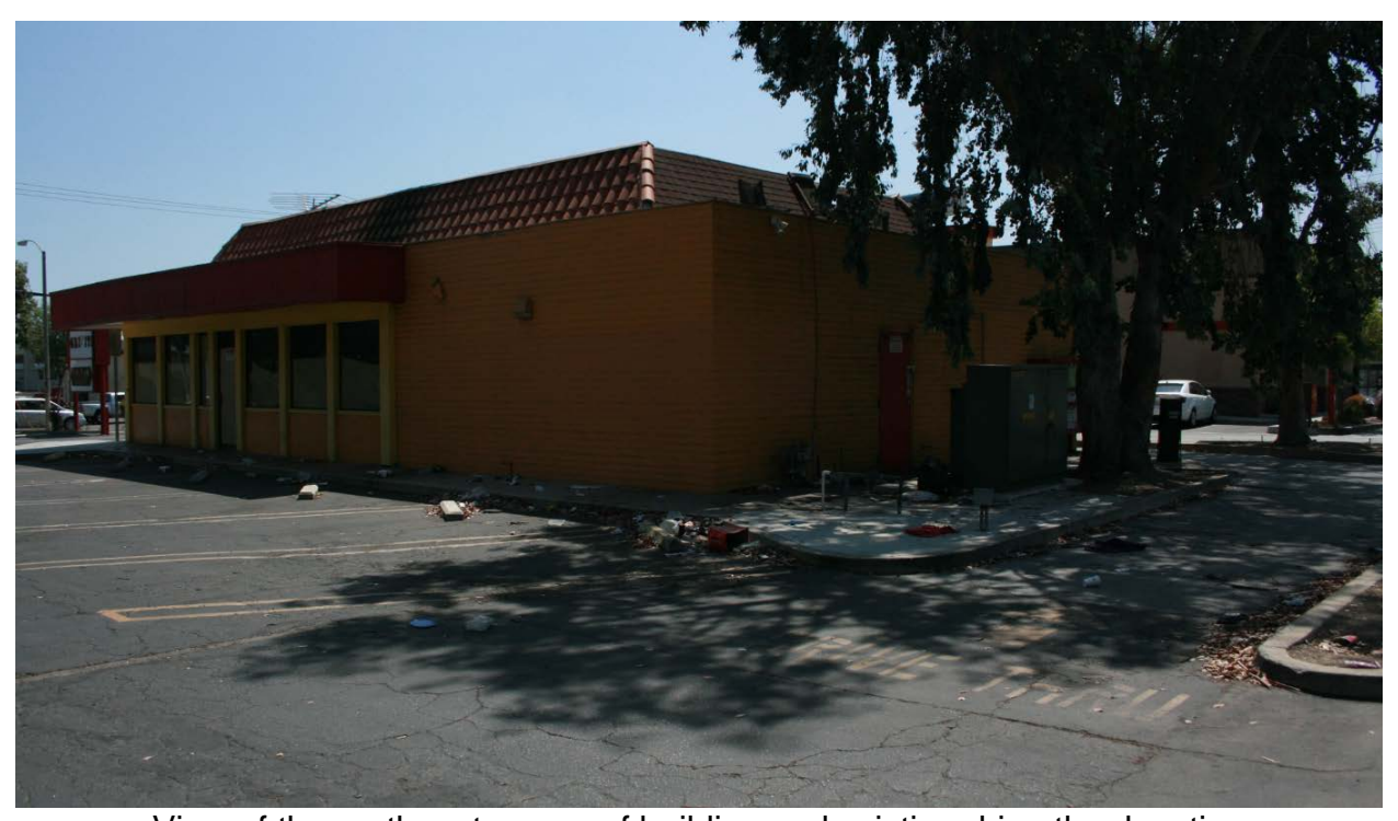
View of the northeast corner of building and existing drive-thru location