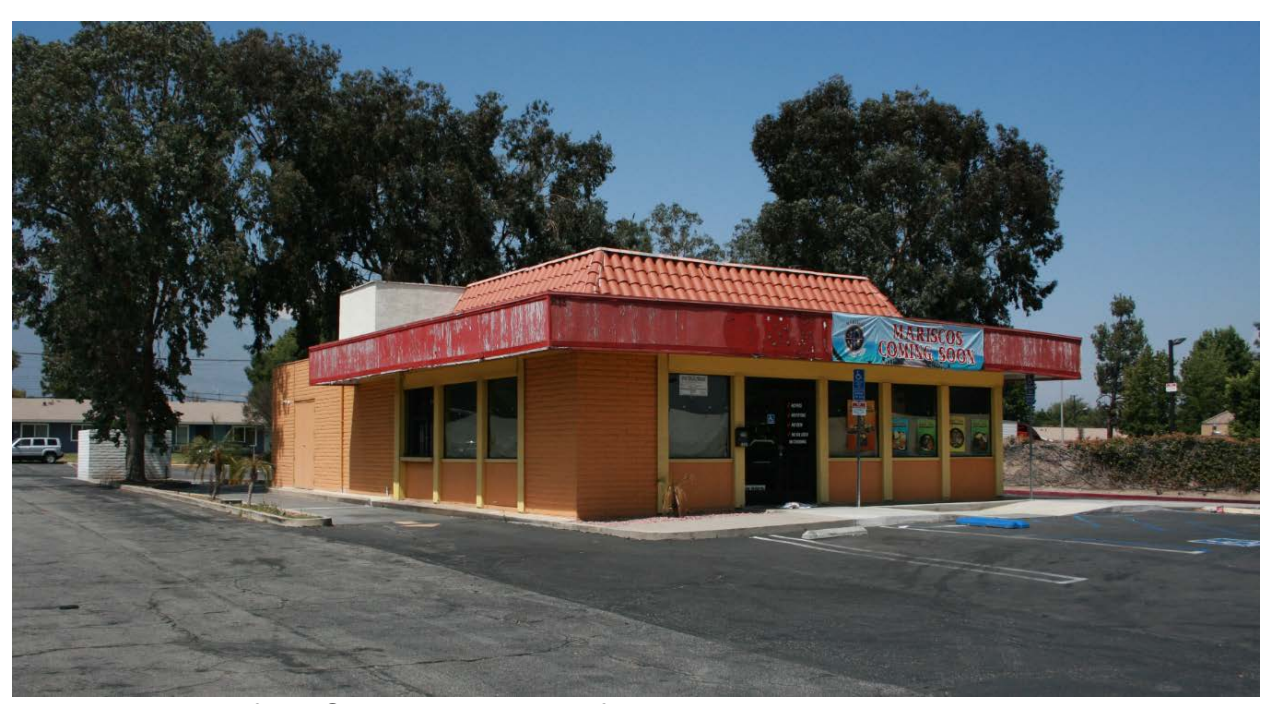
View of the Southwest corner of existing building and main entrance