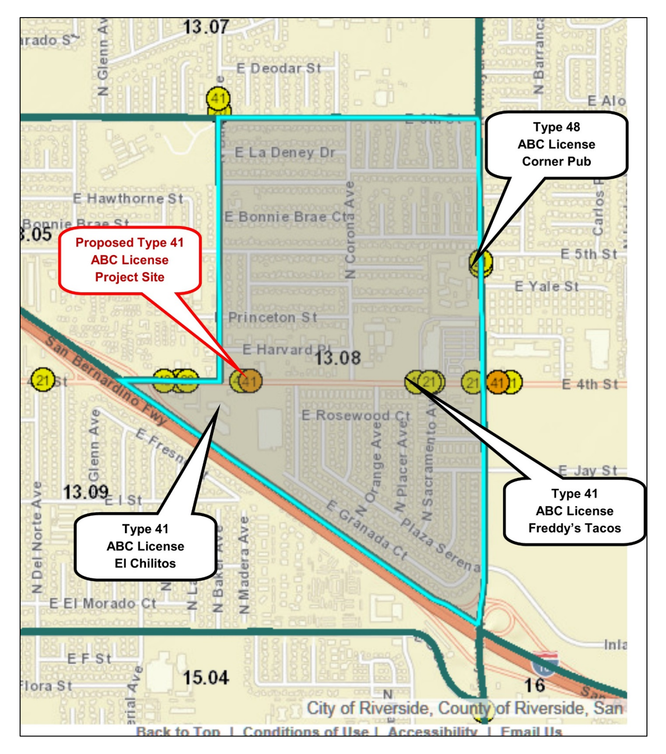
Exhibit E: ABC License Concentration