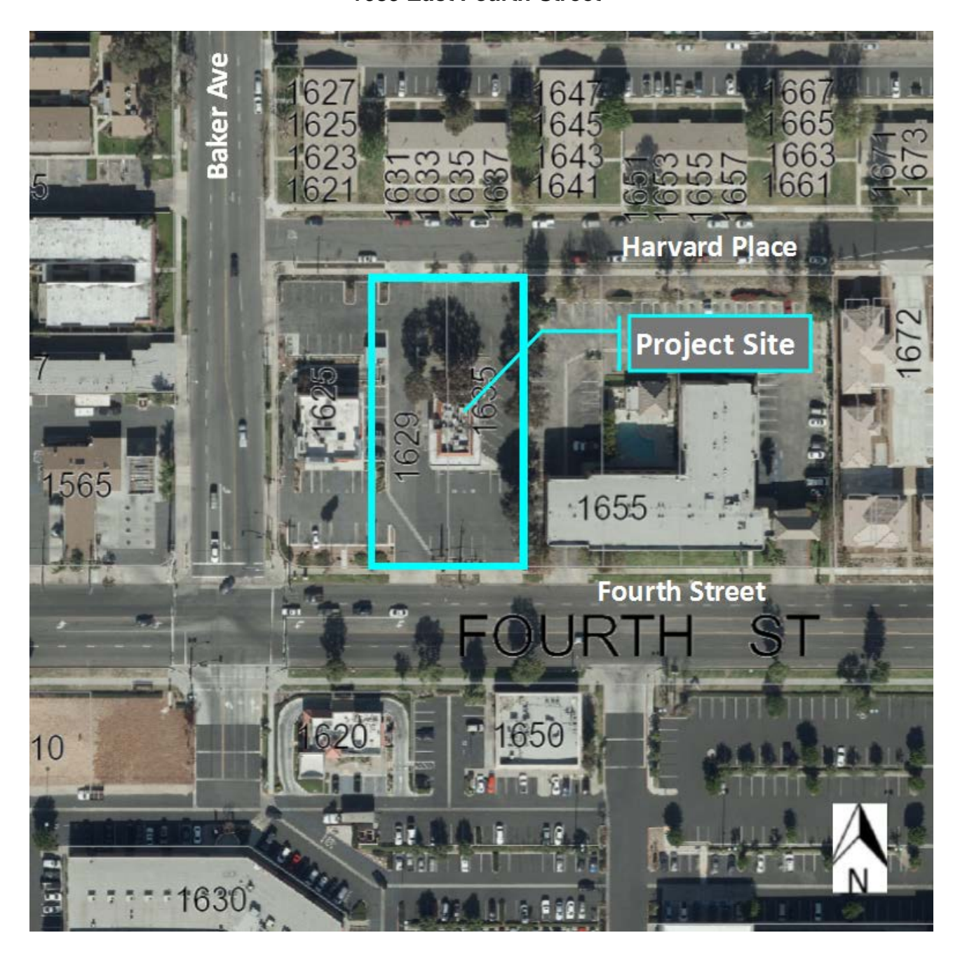
Exhibit A: Aerial Photograph 1635 East Fourth Street