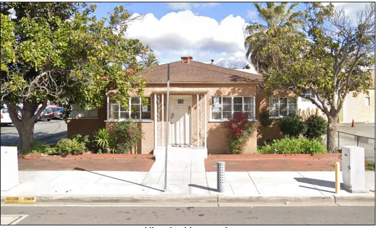
View looking north