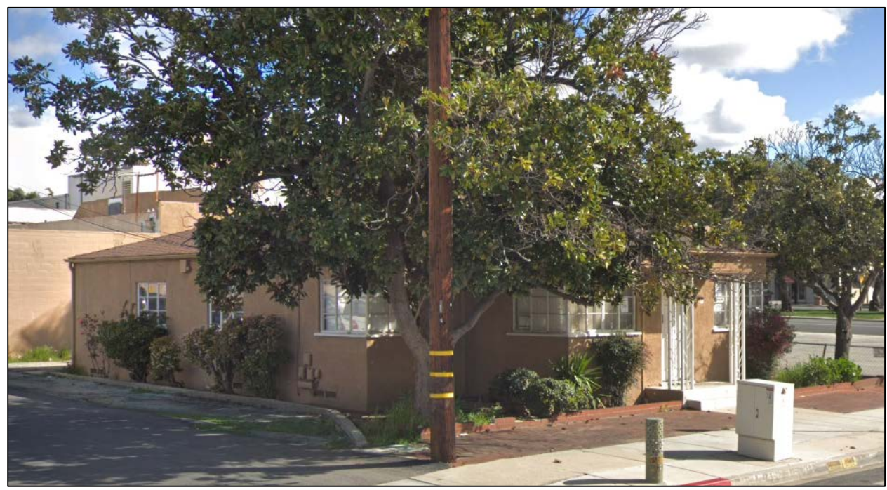
View looking northeast