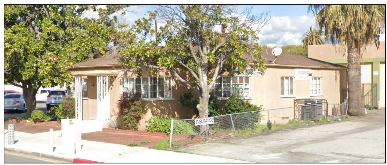
View looking northwest