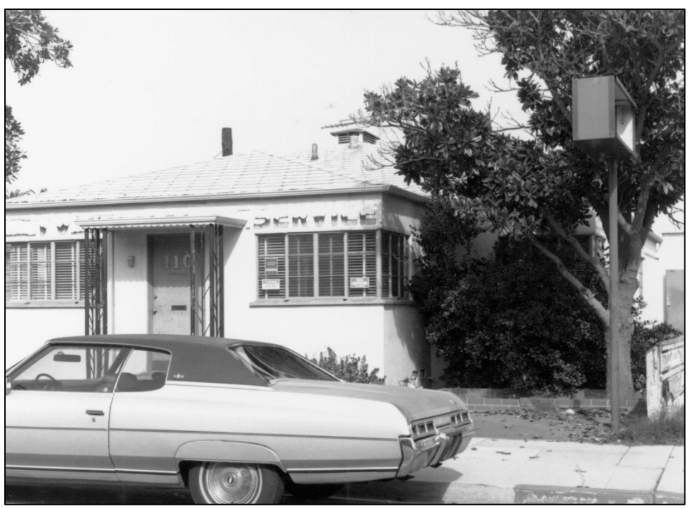
1983 Survey Photograph