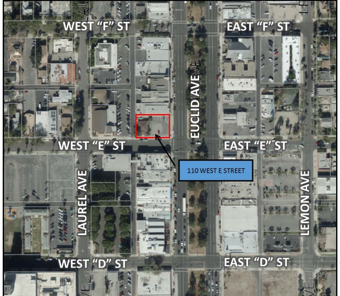
Exhibit A: Aerial Photograph