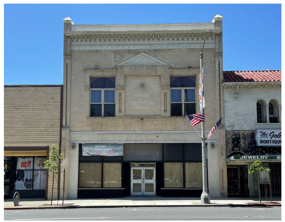
231 North Euclid Avenue (front)