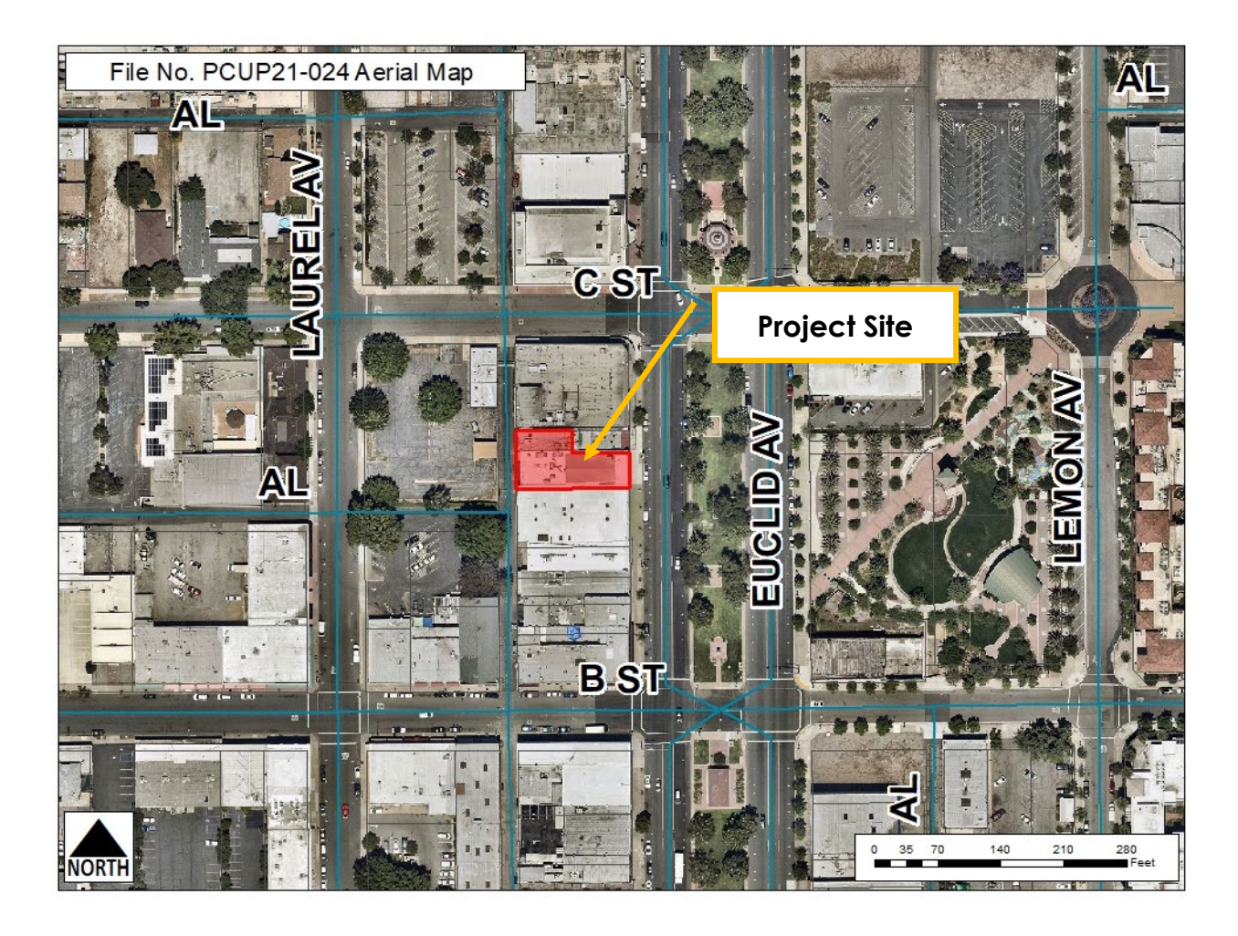
Exhibit A: AERIAL PHOTOGRAPH