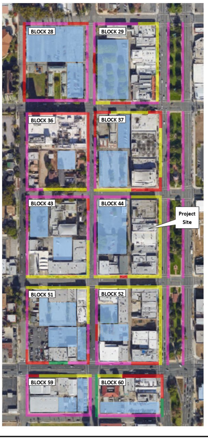
Exhibit D: PARKING BLOCKS