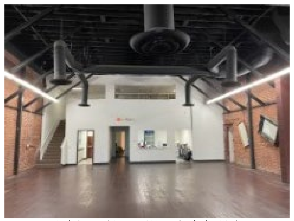
Main Banquet Area and Mezzanine facing West