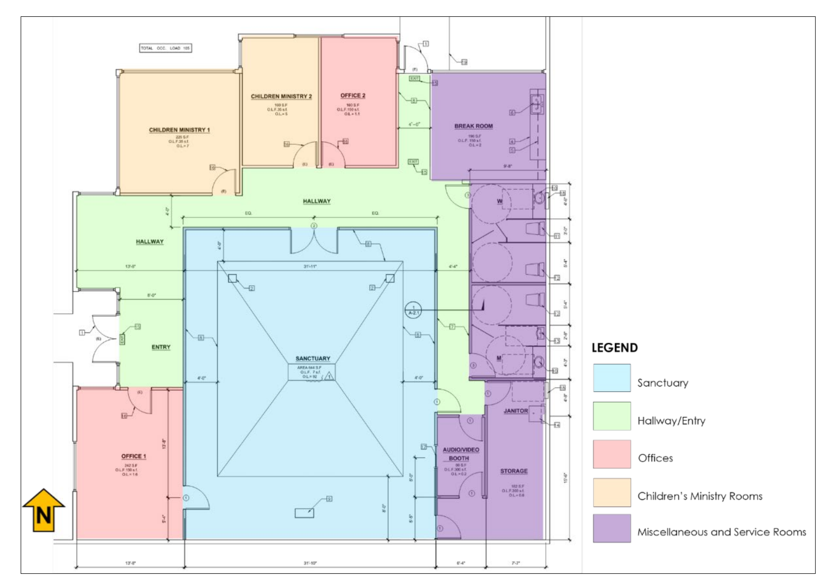
Exhibit C: FLOOR PLAN