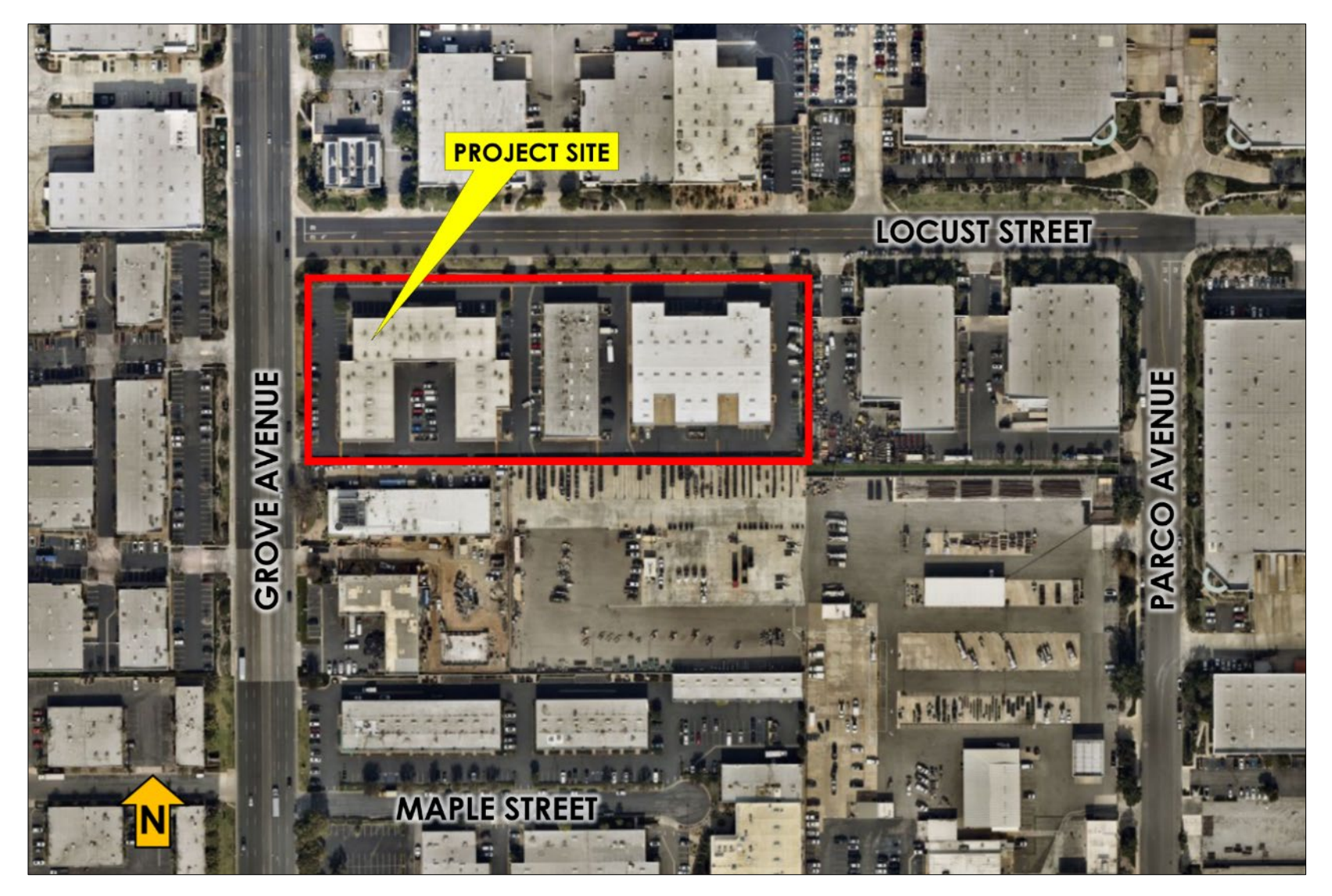
Exhibit A: PROJECT LOCATION MAP