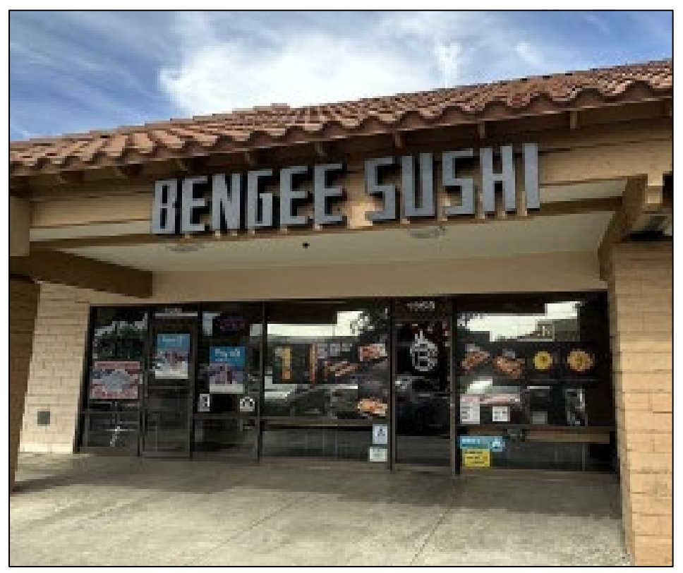
Existing Restaurant Front Entrance