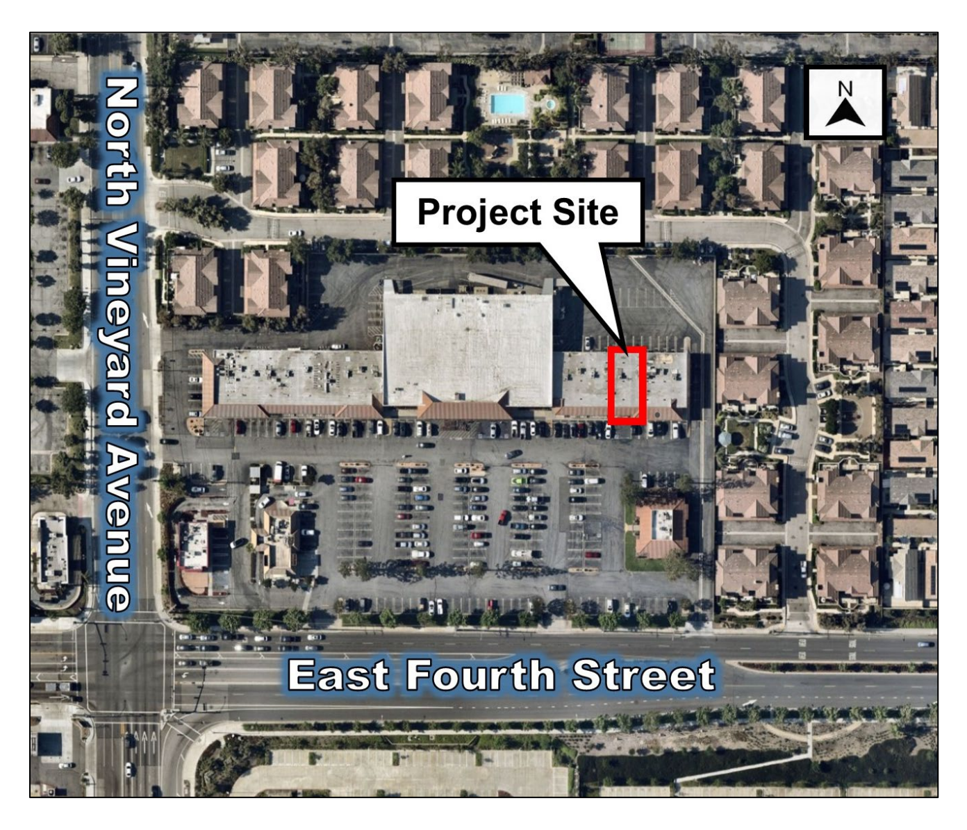
Exhibit A: PROJECT LOCATION MAP