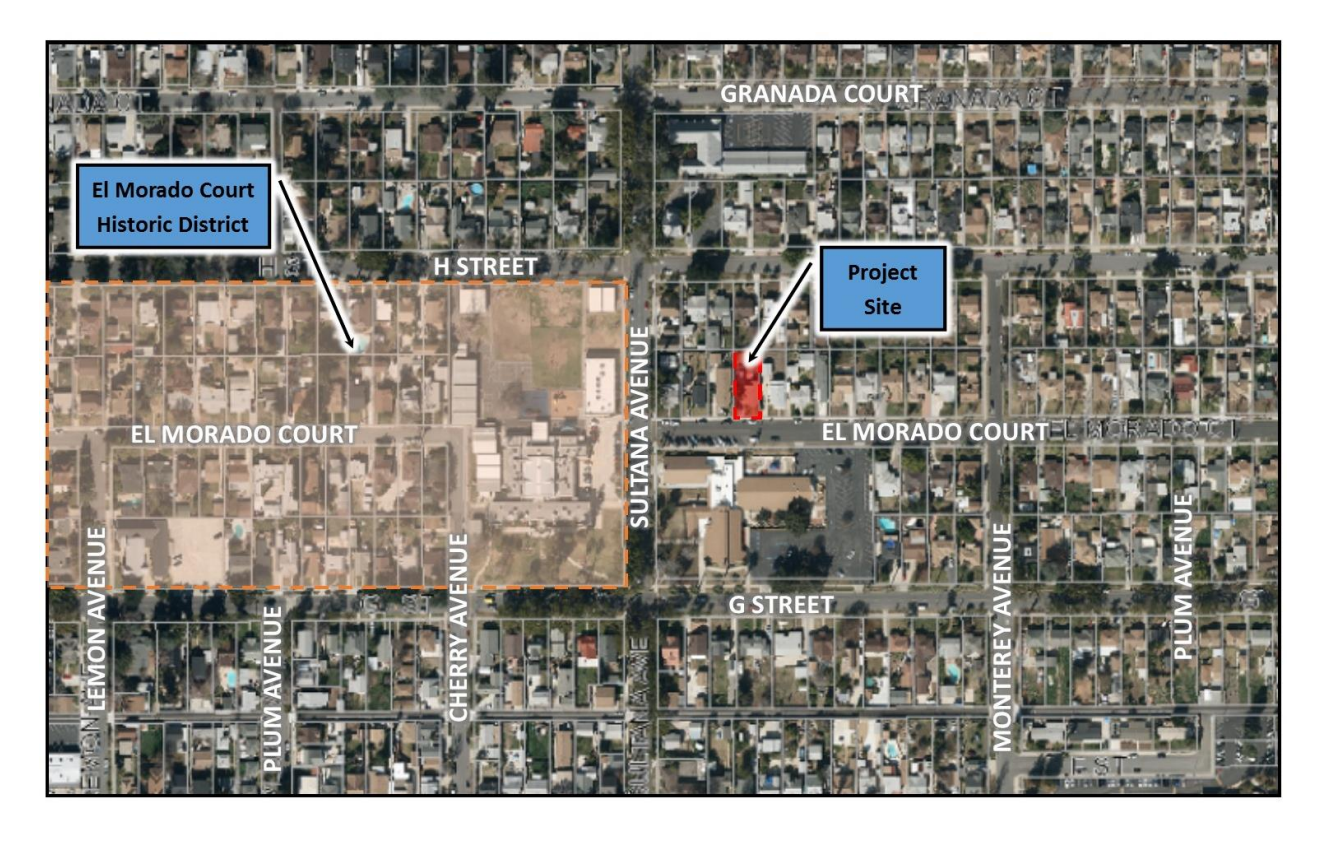
Exhibit A: Project Location Map