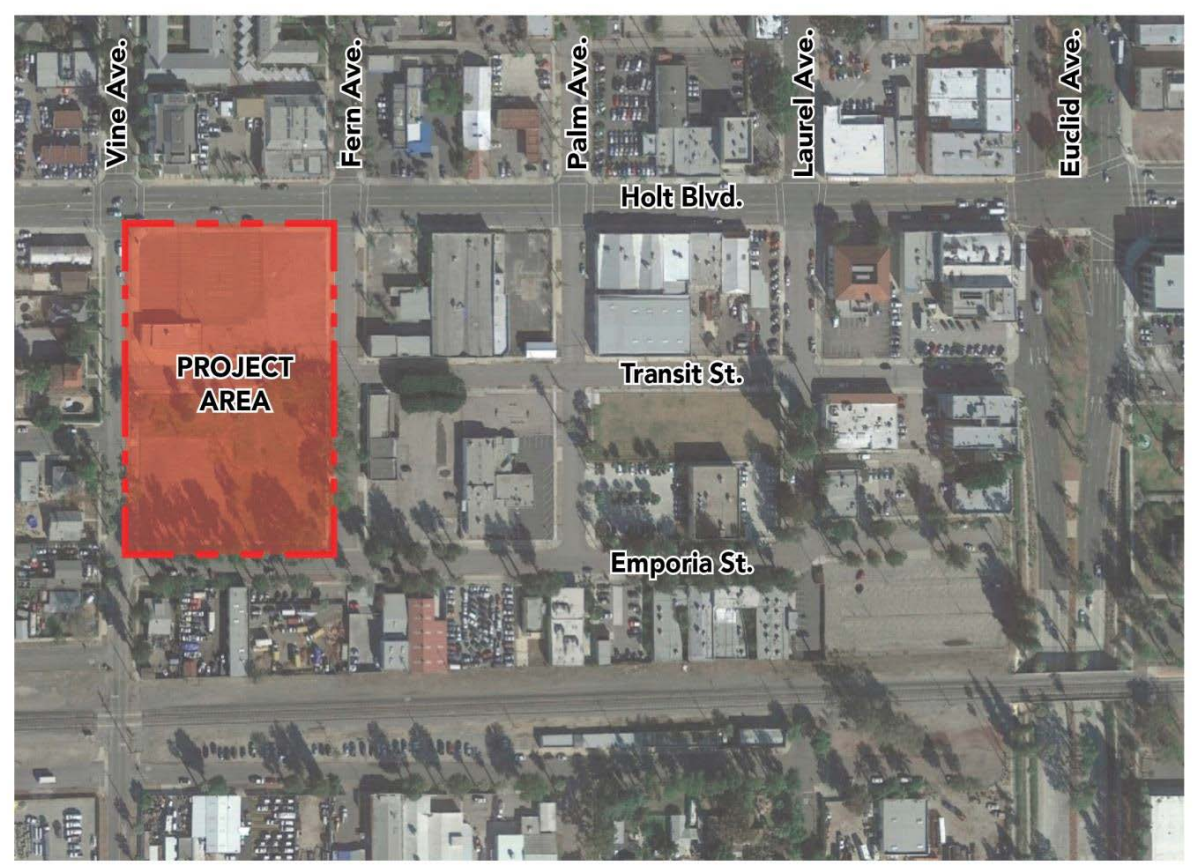
Exhibit A: Project Location Map