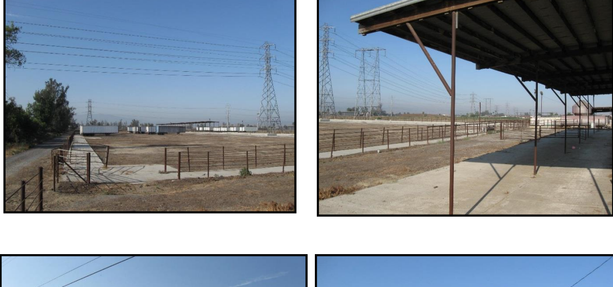
Exhibit C: Site Photos