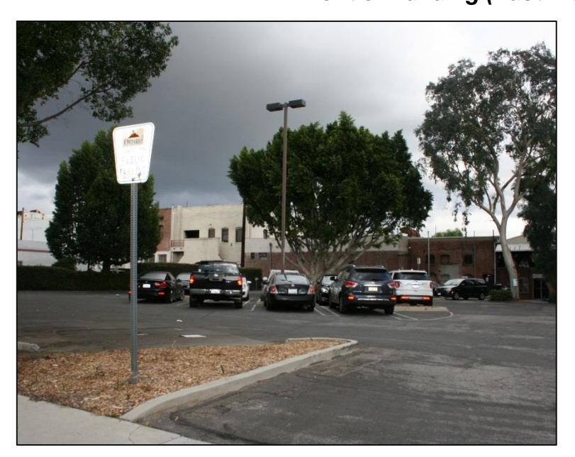
Rear Public Parking Lot (View from Laurel Avenue)