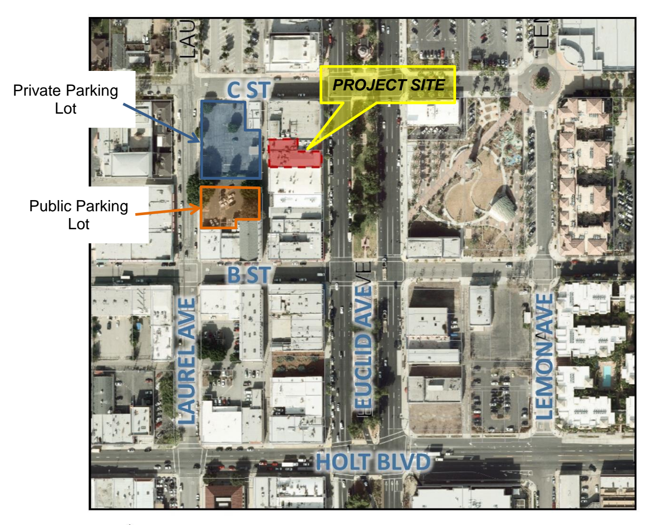
Exhibit A: Aerial Photograph