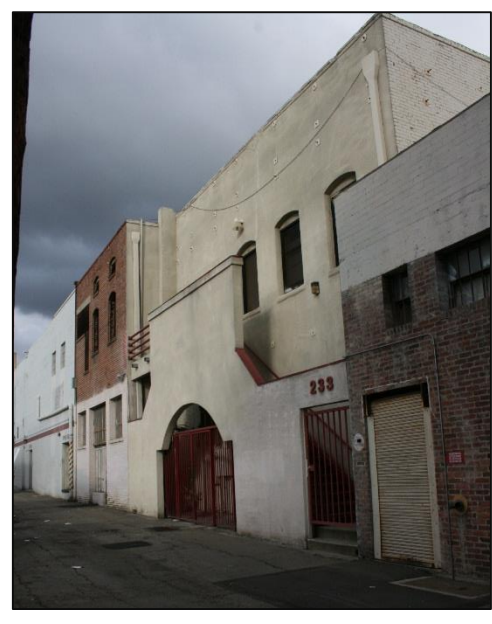
Rear of Building (West Elevation)