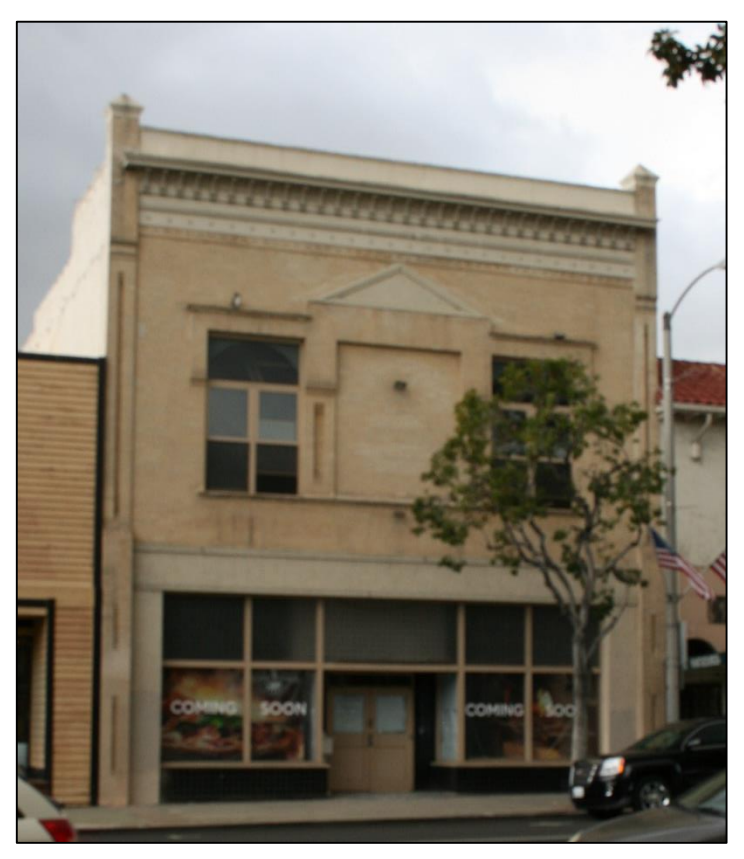
Front of Building (East Elevation)