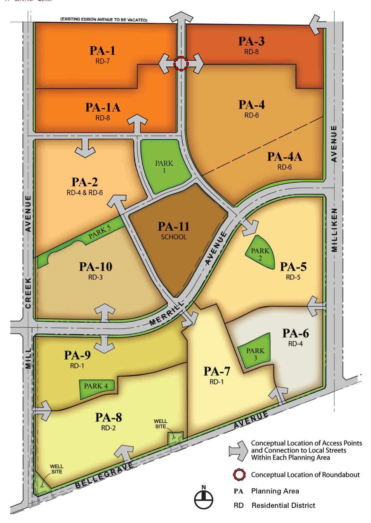
Exhibit 8 Land Use Plan