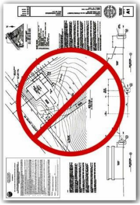
Incorrect orientation will not be accepted