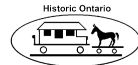
The "Model Colony"