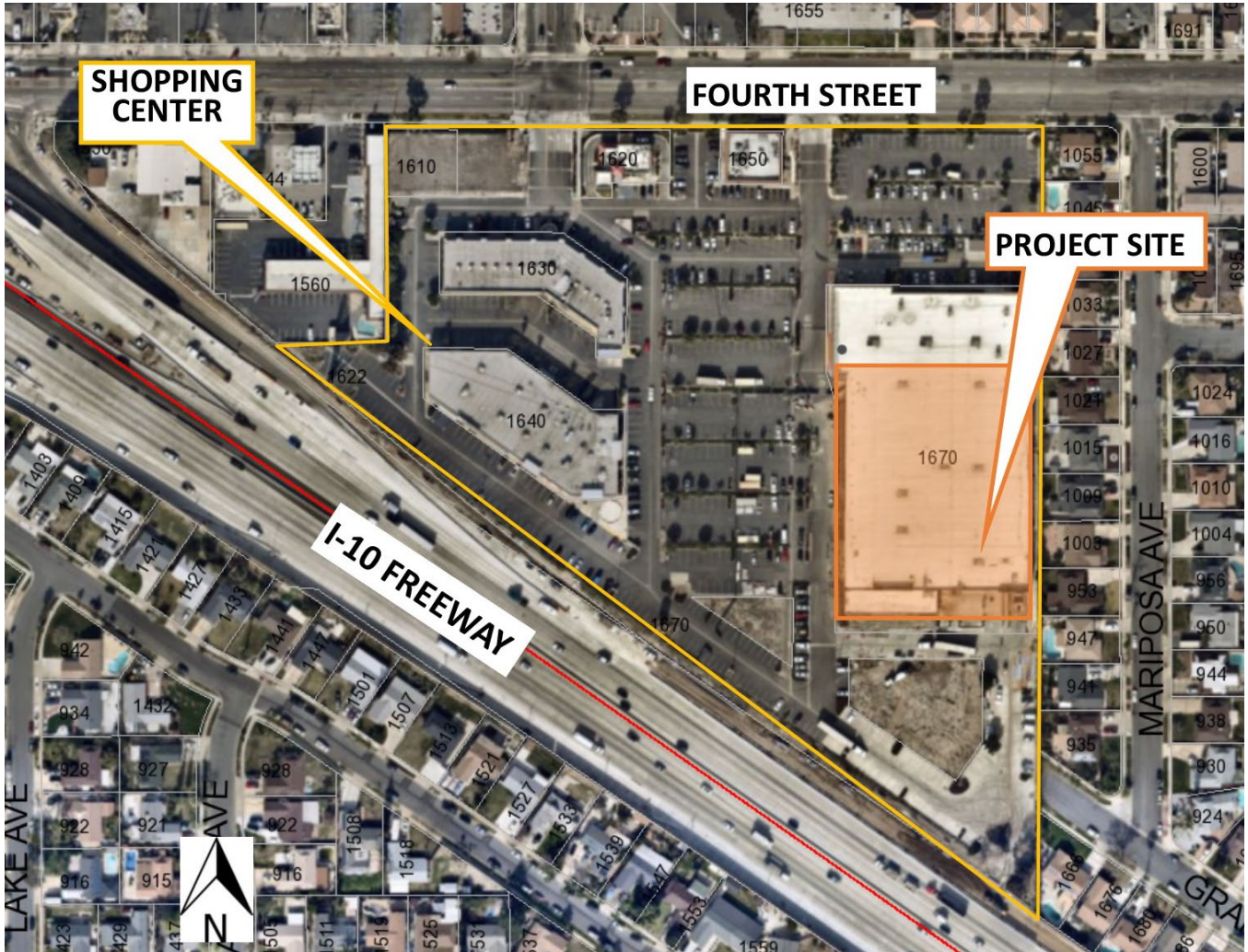
Exhibit A: PROJECT LOCATION MAP